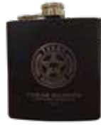
Texas Ranger Flask