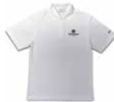
Golf Shirt (assorted colors)