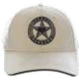
Texas Ranger Cap