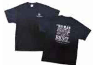
Texas Ranger T-Shirt