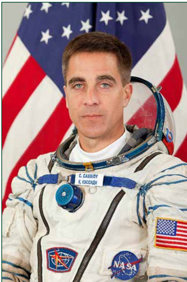
SEAL/Astronaut Captain Chris Cassidy

Cassidy is a native of Maine and graduated from the Naval Academy Preparatory School in Newport, R.I. He then received a bachelor of science in mathematics from